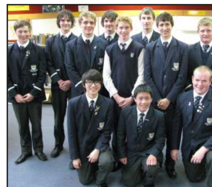
NZ Economics Competition Award Recipients