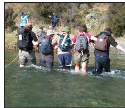
Crossing the Mararoa River