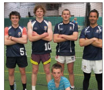
Indoor Touch Champions