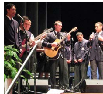
Backing group for leavers song Don't forget your roots.