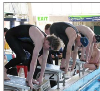
On your marks