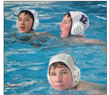
Water Polo - In and around the pool