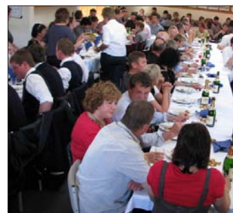
The Dining Room was full for Skipper's Feast