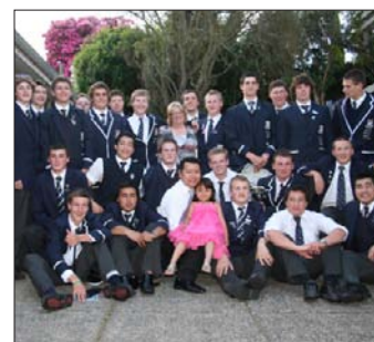
Year 13 Leavers