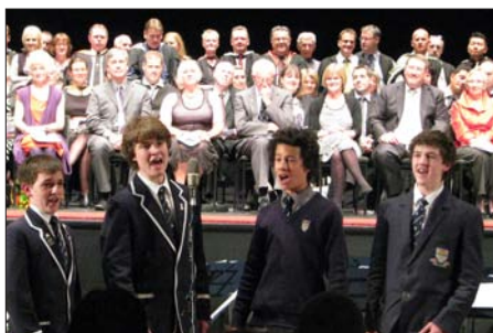
Barbershop Quartet perform Coney Island Baby at Senior Prizegiving