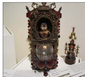
Steampunk - tomorrow as it used to be