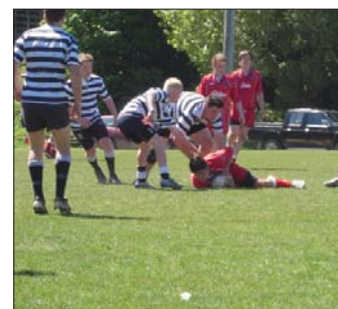
Rugby League team in action