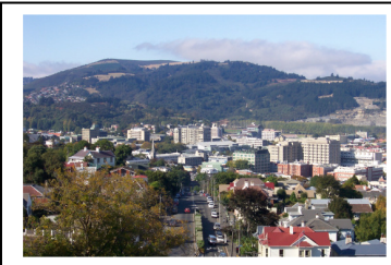
Views of Dunedin City from our Campus